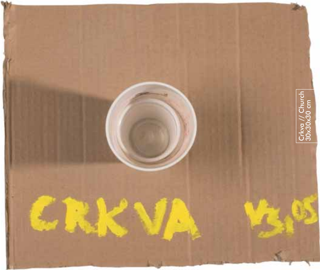
Crkva // Church 30x30x30 cm